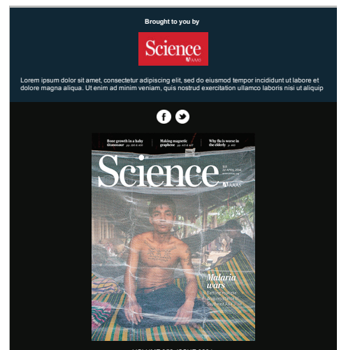
Science Table of Contents with logo and text advertisement