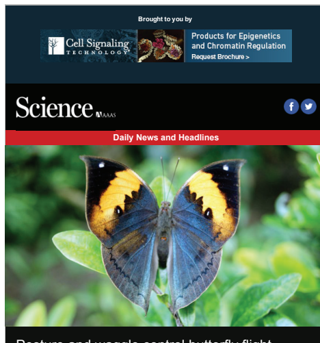
Science Daily News & Headlines with banner advertisement

Science Table of Contents with text-only advertisement